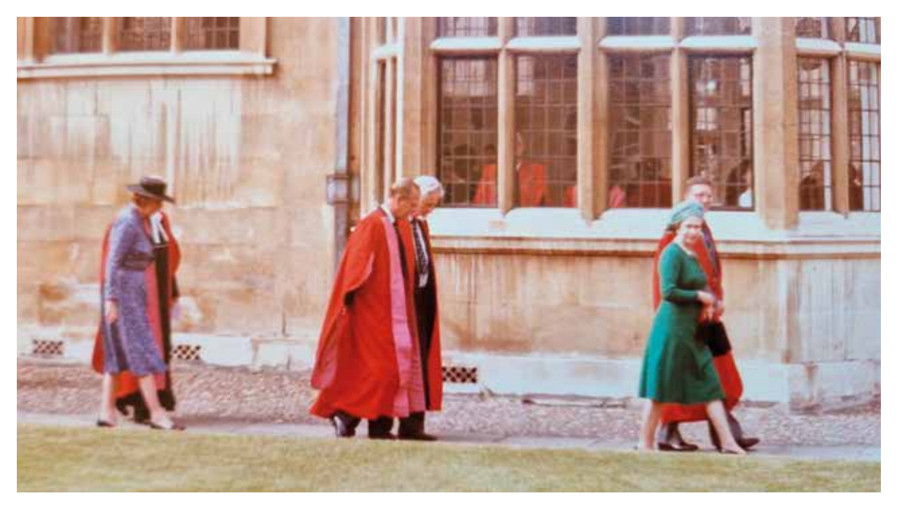
The Royal Party passing through Front Court in 1984

In this Platinum Jubilee year, it is interesting to look back at the two visits made by HM Queen Elizabeth II to our College. On both occasions, she was accompanied by HRH The Duke of Edinburgh, who was Chancellor of the University of Cambridge between 1976 and 2011.